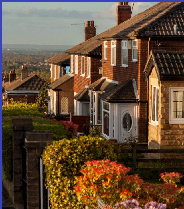
Image for illustrative purposes only. Not an International House Manchester homestay.