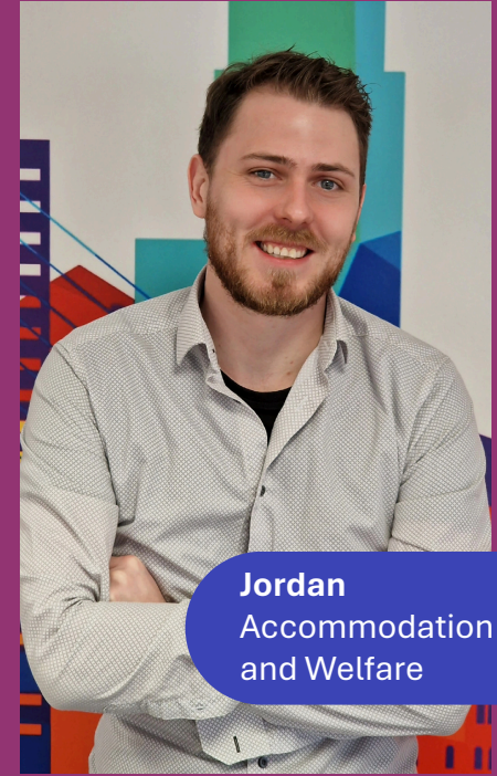
Jordan Accommodation and Welfare